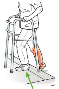
"Up with the good leg."